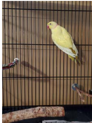
Oscar, Ringneck Parakeet Enlarged heart