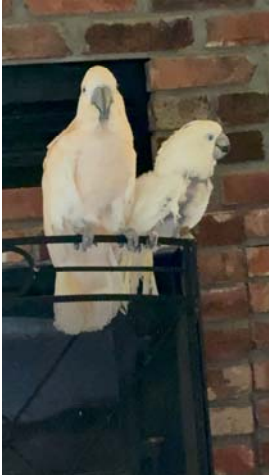
Sophie: Extreme fear of people (smaller of the 2)