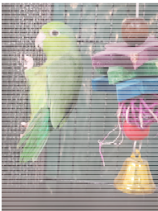
Olive, Parrotlet Cancer