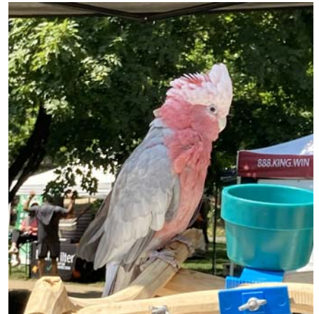
Rosie: Rose Breasted Cockatoo Fearful