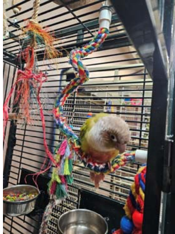
Milo, Green Cheeked conure Facility mascot